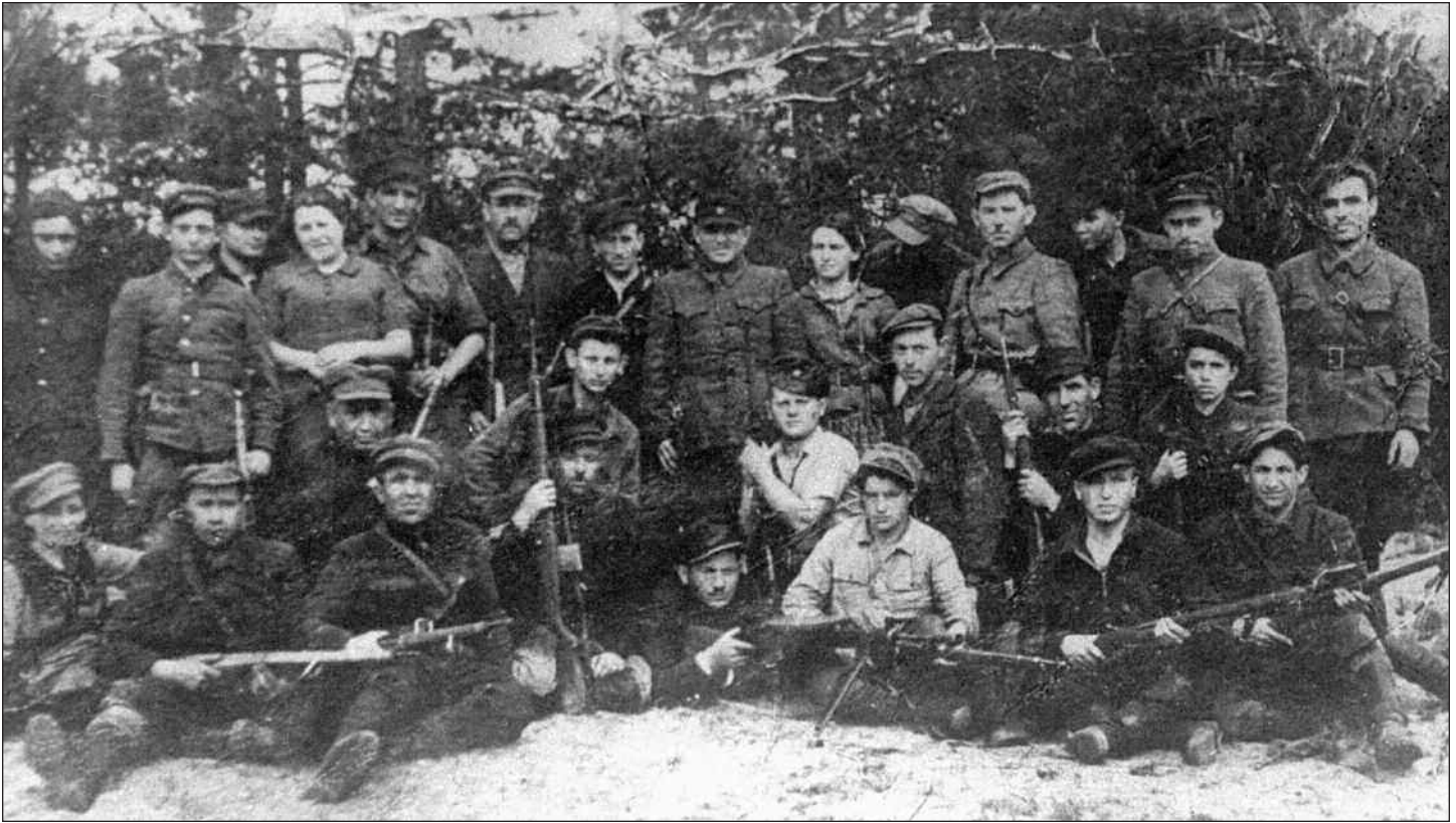
Part of the Bielski unit towards the end of the War. Approximate date 1943-1944.

harder for the Germans to fight the war. Partisans also destroyed German power plants and factories, focusing their attention on military and strategic targets, not on civilians. Most partisan units wanted young men who could fight to join their ranks, and many were hostile to Jews. Not the Bielskis, however. They took in hundreds of the elderly, infirm, women, and children.